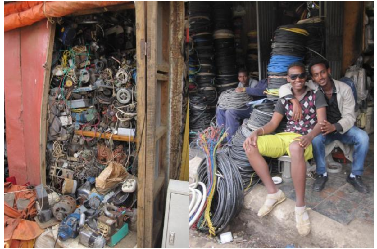
Photo 5 a & b Shops dealing with used EEE in Merkato Market, Addis Ababa