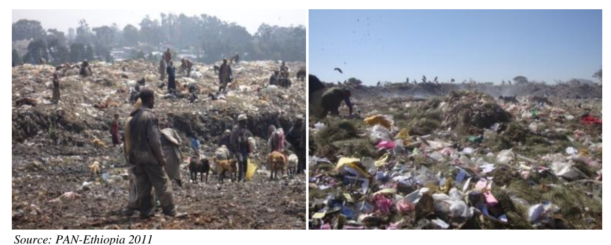
Photo 3 a & b People picking through mixed solid municipal waste in Addis Ababa (left) and Bahir Dar (right)

A significant disadvantage of this waste collection system is that it gives a monetary incentive to collectors to focus their collection efforts on high volume waste such as organic waste (grass, leaves etc.).Some of this organic waste does not necessarily need waste treatment. Furthermore, this system provides no incentive for composting.