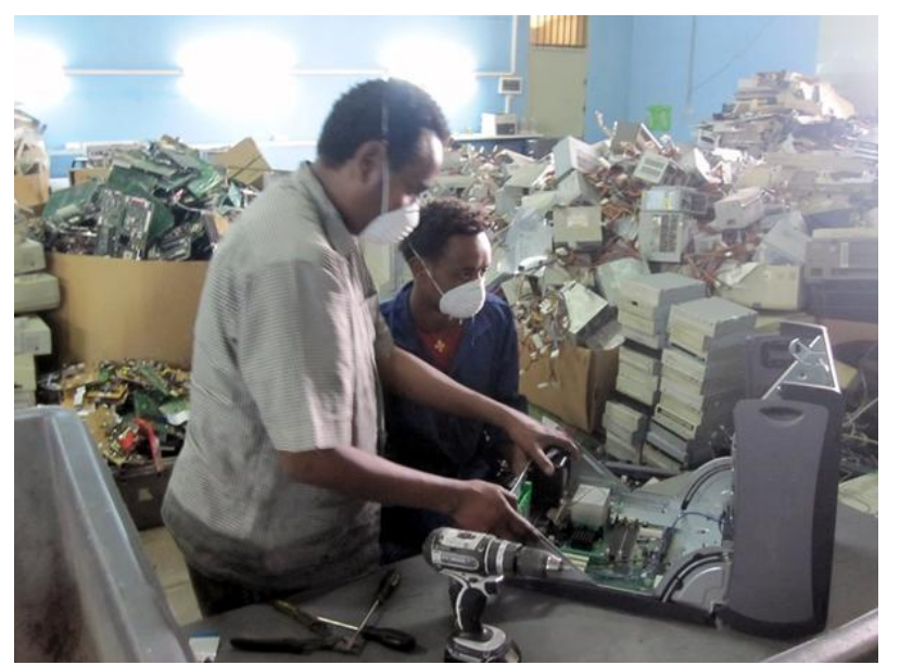
Photo 4 Computer dismantling in the Demanufacturing Facility in Akaki