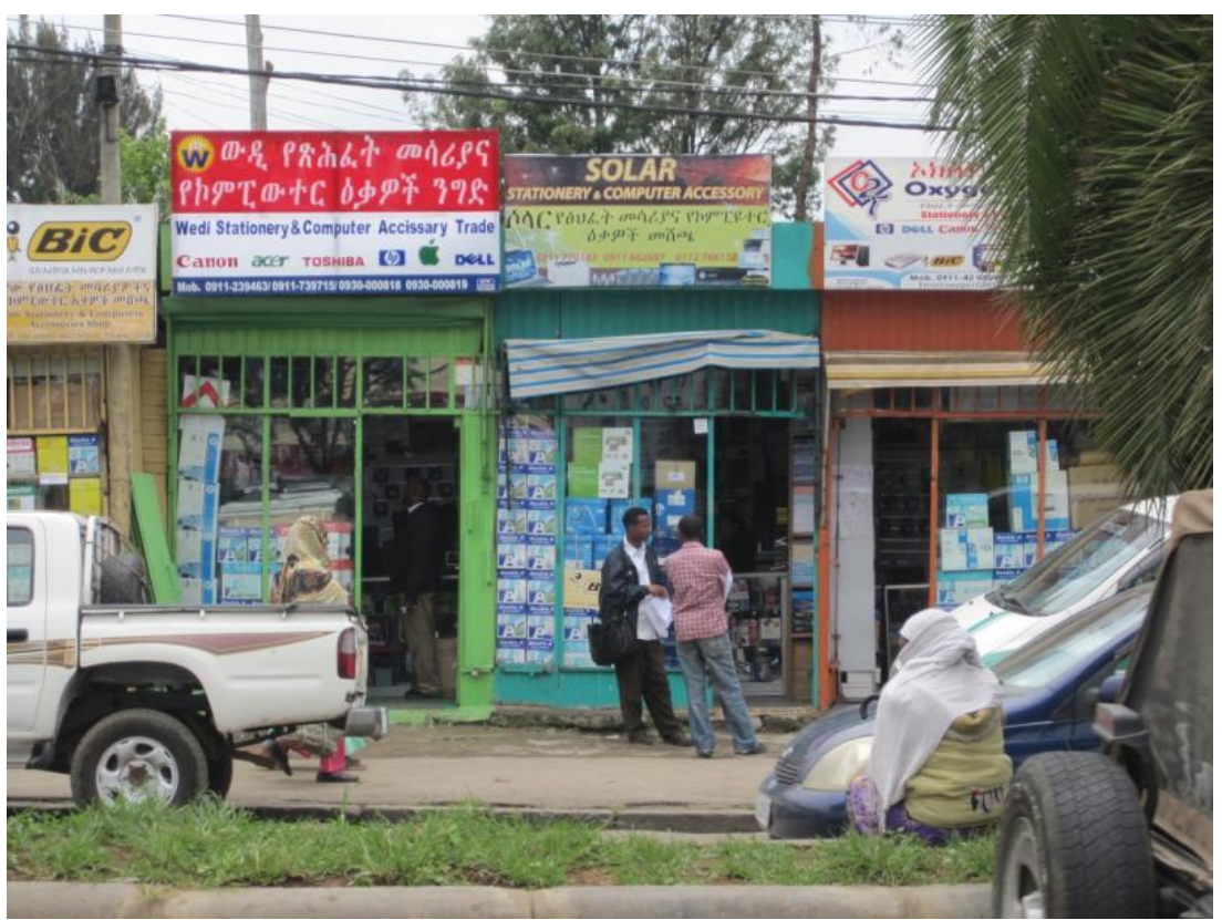
Photo 1 Electronic equipment retail shops in Kazanchis, Addis Ababa

over urban Ethiopia. In Addis Ababa, one major distribution cluster is located in the Kazanchis area, where more than 100 shops sell new and used electronic products such as printers, copy machines, computers and mobile phones.