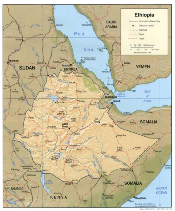
Figure 1 Shaded relief map of Ethiopia